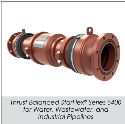
Thrust Balanced StarFlex® Series 5400 for Water, Wastewater, and Industrial Pipelines

Thrust Balanced Flexible Expansion Joint for the Protection of Water, Wastewater, and Industrial Pipelines Sizes 4"-36"