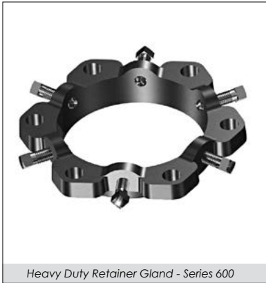
Heavy Duty Retainer Gland - Series 600