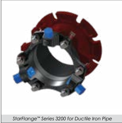
StarFlange™ Series 3200 for Ductile Iron Pipe

Restrained Adapter Flange Coupling for Ductile Iron Pipe