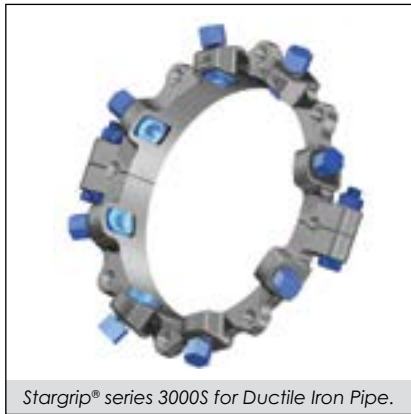
Stargrip® series 3000S for Ductile Iron Pipe.