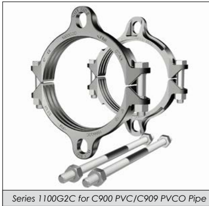
Series 1100G2C for C900 PVC/C909 PVCO Pipe

1100G2C Bell Restrainers for AWWA CI OD C900/C909 PVC/PVCO Pipe Joints (Formerly Series 9100)