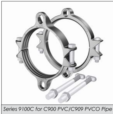
Series 9100C for C900 PVC/C909 PVCO Pipe

The 9200 was introduced in Canada first and has been well received. The product's better performance on AWWA C900 and C909 has resulted in this product becoming the company's new standard offering in 4" through 12". As the 1200 family is a widely recognized brand of pipe restraint, the 9200 has been renamed 1200G2. The 1200G2 is replacing the 1200C in sizes 12" and down for use on CI OD pipe.