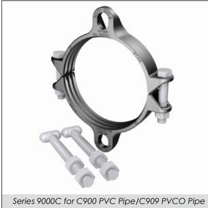
Series 9000C for C900 PVC Pipe/C909 PVCO Pipe

The 9000 was introduced in Canada first and has been well received. The product's better performance on AWWA C900 and C909 has resulted in this product becoming the company's new standard offering in 4" through 12". As the 1000 family is a widely recognized brand of pipe restraint, the 9000 has been renamed 1000G2. The 1000G2 is replacing the 1000C in sizes 12" and down for use on CI OD pipe.