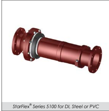
StarFlex® Series 5100 for DI, Steel or PVC

Single-Ball Flexible Expansion Joint for the Protection of Water, Wastewater, and Industrial Pipelines