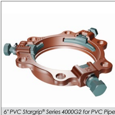
6" PVC Stargrip® Series 4000G2 for PVC Pipe

Mechanical Joint Wedge Action Restraint for Plastic Pressure Pipe Patent Pending