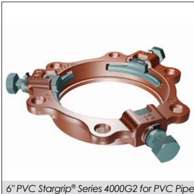
6" PVC Stargrip® Series 4000G2 for PVC Pipe

Mechanical Joint Wedge Action Restraint for Plastic Pressure Pipe Patent Pending