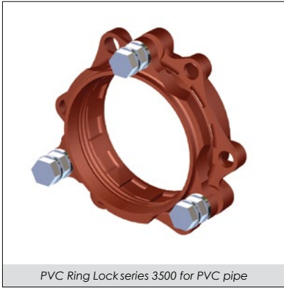
PVC Ring Lock series 3500 for PVC pipe

Mechanical Joint 360° Ring Type Restraint System Designed for C900/C905 and IPS PVC Pipe Patent #5,947,527