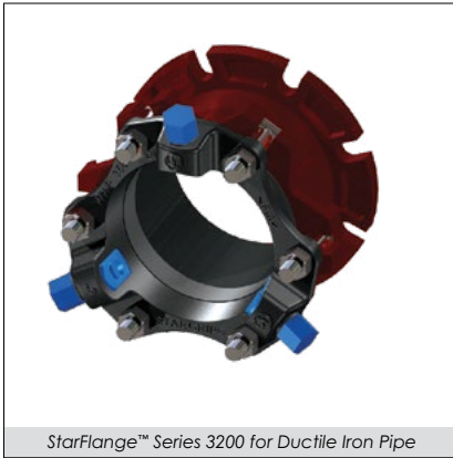
StarFlange™ Series 3200 for Ductile Iron Pipe

Restrained Adapter Flange Coupling for Ductile Iron Pipe