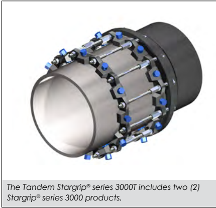
The Tandem Stargrip® series 3000T includes two (2) Stargrip® series 3000 products.

For High Pressure DI Pipe to MJ Fitting Applications