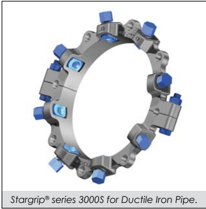
Stargrip® series 3000S for Ductile Iron Pipe.

Split Mechanical Joint Wedge Action Restraint for New or Existing Ductile Iron Pipe Patent #5,772,252