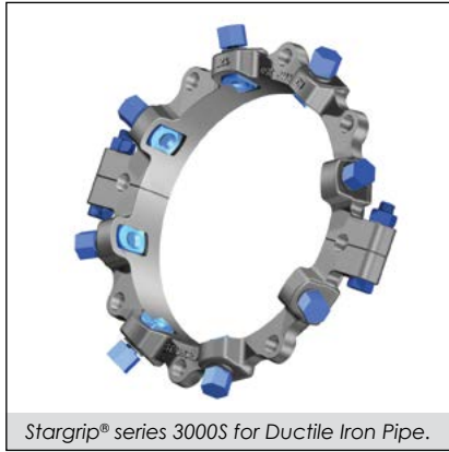
Stargrip® series 3000S for Ductile Iron Pipe.

Split Mechanical Joint Wedge Action Restraint for New or Existing Ductile Iron Pipe Patent #5,772,252