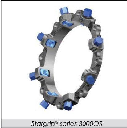
Stargrip® series 3000OS

Mechanical Joint Wedge Action Restraint for A, B, C & D Pit Cast Pipe Patent #5,772,252