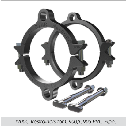
1200C Restrainers for C900/C905 PVC Pipe.

1200C Restrainers for PVC Pipe and PVC Pressure Fittings w/Ductile Iron Pipe OD