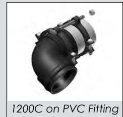
1200C on PVC Fitting