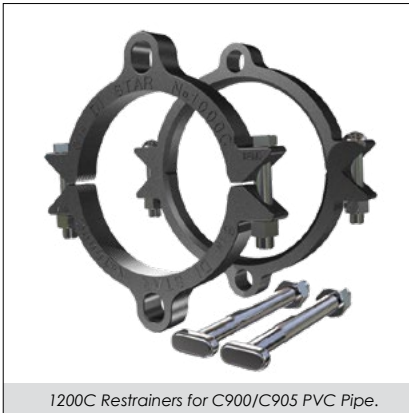
1200C Restrainers for C900/C905 PVC Pipe.

1200C Restrainers for PVC Pipe and PVC Pressure Fittings w/Ductile Iron Pipe OD