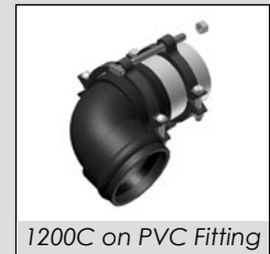
1200C on PVC Fitting