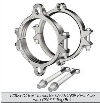
1200G2C Restrainers for C900/C909 PVC Pipe with C907 Fitting Bell

1200G2C Restrainers for C900/C909 PVC/PVCO Pipe and PVC Pressure Fittings w/Ductile Iron Pipe OD (Formerly Series 9200)