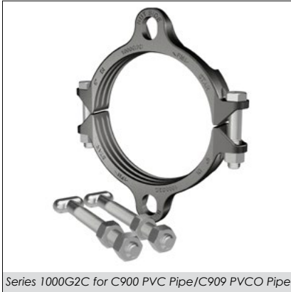
Series 1000G2C for C900 PVC Pipe/C909 PVCO Pipe

1000G2C Restrainers for AWWA CI OD C900/C909 PVC/PVCO Pipe with MJ or Ductile Iron Push-On Fittings (Formerly Series 9000)